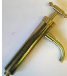
SUMP PUMP ENGINE 3/8 BSP P274590