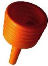
ANTI ROLL FUNNEL P27480 6.60 P27481 7.85