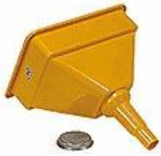
FUNNEL YELLOW P10751 19.34