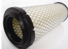
SHIRE AIR FILTER P119808 52.81