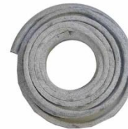
PTFE GLAND PACKING Q019 1/8" 3.95 Q020 3/16 4.90 Q021 3/4 6.00 Q022 5/16" 8.40 Q023 3/8" 12.20 Q024 1/2" 21.54