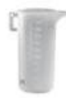
OIL MEASURE PLASTIC JUG P26897 1.36