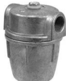
OIL INLINE FILTER 3/8 U405202 16.99