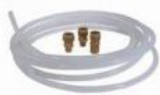
STERN TUBE GREASER KIT P274910 10.92