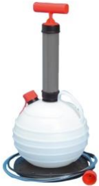
PELLA OIL EXTRACTOR P6060 40.85 Q26897 P400 61.25