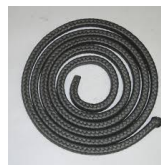
GRAPPHITE GLAND PACKING Q203012 1/4" 2.58 Q203013 5/16 3.60 Q2030014 3/8 7.63