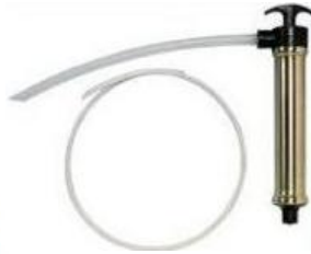
OIL SUMP PUMP P1128 17.42