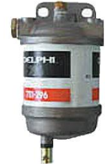
DELPHI FUEL FILTER COMP P276939