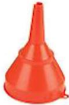
STD FUNNEL SET 3 P403775 2.50