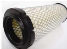
RDG6599 AIR FILTER 600 X450 SHIRE 22.75