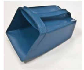
BAILER SCOOP P44675 2.79