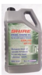
SHIRE 15-40 Q6110 29.30