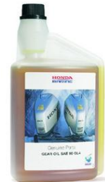
HONDA 12.82 GEAR OIL Q08251999101