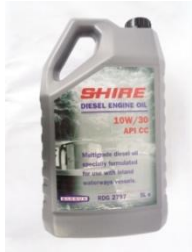
SHIRE OIL 10W-30 Q2797 28.99