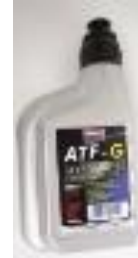
ATF FLUID TRANSMISSION Q