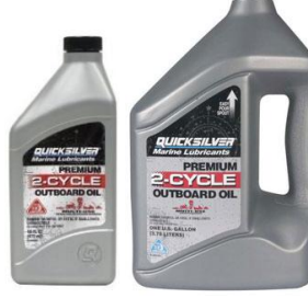
QUICKSILVER 2 STROKE OIL Q858021 1L 10.05 Q 858022 4L 38.56