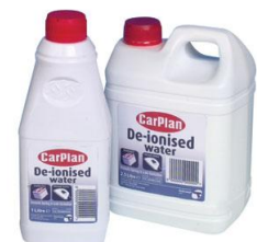
DE-IONISED WATER Q370114 1LT 2.29 Q370115 5LT 5.49