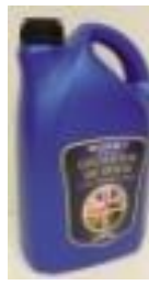
MORRIS SERV 10W-30 Q274920 DIS