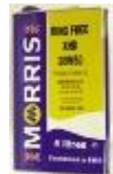
MORRIS HXD 20W-50 Q274921 25.48