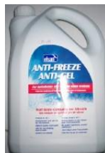
ELSAN GLYCOL FREE ANTI FREEZE Q9418 19.99