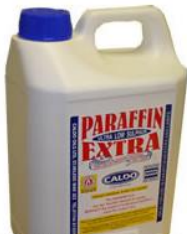
PARAFIN 4LT Q700 11.25