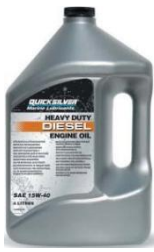
QUICKSILVER DIESEL OIL SAE15W-40 Q858042 4L 27.52