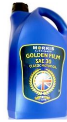
MORRIS SAE30 SUPREME CLASSIC Q274923 29.22