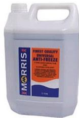
MORRIS ANTI-FREEZE Q274972 5LT 25.42 Q274970 1LT 5.92