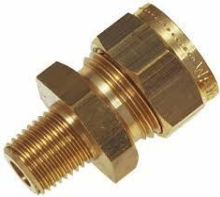
MALE BSP TAPER Stud Tube to bspt