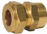
FEMALE STUD COUPLING TUBE - F/M BSP PARALLEL