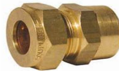
FEMALE STUD COUPLING TUBE - F/M BSP TAPER