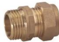
MALE BSP PARALLEL THREAD COUPLING