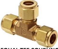
EQUAL TEE COUPLING