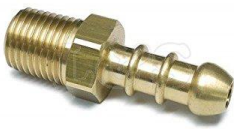
GAS HOSE TAIL MALE BSP TAPER