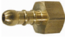
GAS HOSE TAIL F/MALE BSP