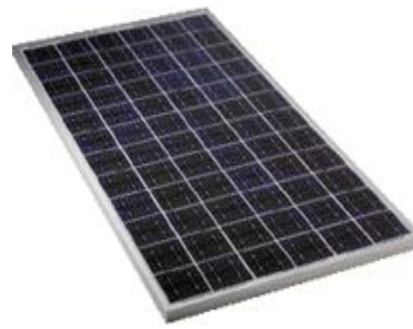
SPECTRA D881030 5W D105666 10W D881032 20W