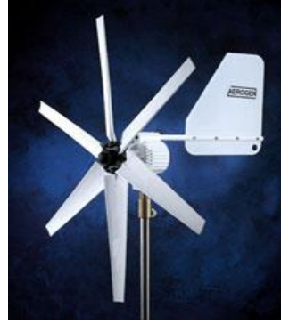
AEROGEN 6 £1,417.20

Mid-sized wind generator for cruising yachts. Weighs 8½kg, rotor Ø 870mm Continuous output is 2 amps at 13 knots, 6 amps at 20 knots. Operates safely and continuously in storms and can produce up to 19 amps in 60 knots of wind.