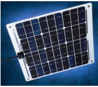
SOLAR PANNELS D105700 200WH/D D105705 300WH/D D105710 440WH/D