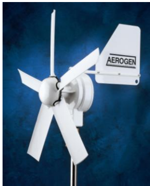
D412 AEROGEN 4 £920.00

Mid-sized wind generator for cruising yachts. Weighs 8½kg, rotor Ø 870mm Continuous output is 2 amps at 13 knots, 6 amps at 20 knots. Operates safely and continuously in storms and can produce up to 19 amps in 60 knots of wind.