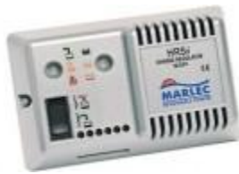
WIND CHARGER CONTROLLERS D105621 HRSI 159.95 D105622 REMOTE FOR WG1200 139.95

Powerful wind generator for cruising yachts and live-aboard vessels. Weighs 12½kg, rotor Ø 1220mm Output is 4 amps at 12 knots, & 10 amps at 20 knots. It operates safely and continuously in storms and can produce 30 amps continuously in winds of 45 knots plus more