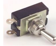
E1020020 1.79 SPARE PANNEL SWITCH