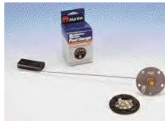
FUEL TANK SENDER E18930