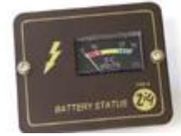
ZIG VOLT MASTER E006220 35.99