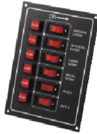
E1010011 29.66 6 WAY FUSE PANEL 165 X 114MM