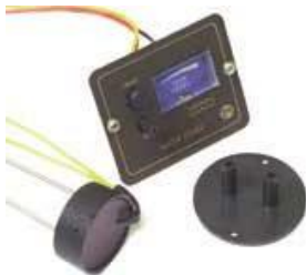
ZIG WATER GAUGE E006301 69.68 FRESH WATER AND WASTE WATER PLASTIC OR METAL TANKS PROBE LENGTH 390MM CAN BE CUT TO SIZE FASCIA DIMENSIONS: 82MM X 70MM