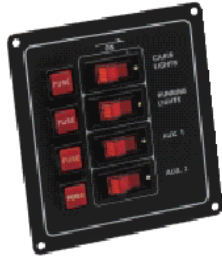
E1010014 22.16 4 WAY FUSE PANEL 127 X 114MM