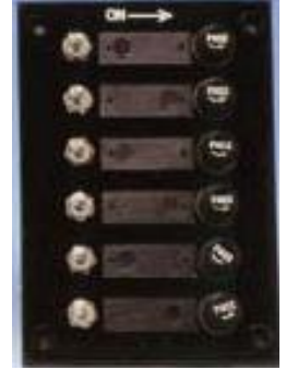
E2041 6 WAY STD 22.22