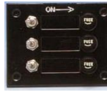
E1030253 3WAY 14.99 88 X 114