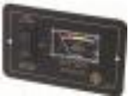
ZIG CPX7 CONTROL PANNEL