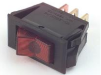
E10200117 1.79 ILLUMINATION ON/OFF SWITCH