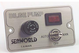
FUSED BILGE SWITCH E1030014 PANNEL 14.33