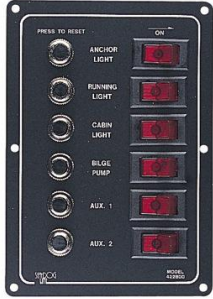
E1070013 39.99 N C B FUSE PANEL 165X114MM 1 X 10 AMP FUSE 2 X 6 AMP 1 X 8 AMP FUSE 2 X 3 AMP