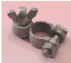
BATTERY TERMINALS 8mm BUTTERFLY STUD E805013 POS 3.50 E805012 NEG 3.50