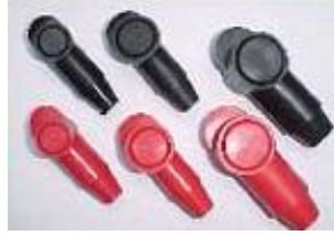
RED BLACK 6mm E824008 E824009 3.07 10-25mm E824010 E824011 3.59 35-70mm E824012 E824013 4.26 95-120mm E824014 E824015 4.58