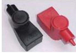
BATTERY POST COVER E824005 25-35-40mm 5.99 E824006 50-70 5.99