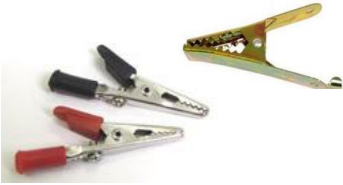
E867 SM 5amp 1.80 E868 MD 25amp 2.30 E869 LG 50amp 3.35