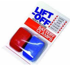
LIFT OFF BATTERY BATTERY TERMINAL COVER E805080 15.31 E866 POS 3.25 E865 NEG 3.25