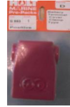
BATTERY TERMINAL COVER E663 POS RED 3.25 E894 NEG BLUE 3.25