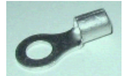
50mm cable E805251 8mm hole 4.53 E805252 10mm hole 4.53 70mm cable E805261 8mm hole 5.66 E805262 10mm hole 5.66