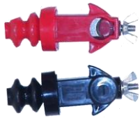
QUICK RELEASE E100405