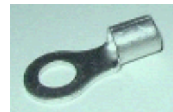
50mm cable E805251 8mm hole 4.53 E805252 10mm hole 4.58 70mm cable E805261 8mm hole 5.66 E805262 10mm hole 5.66