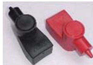
BATTERY POST COVER E824005 25-35-40mm 5.99 E824006 50-70 5.99