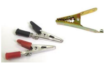
E867 SM 5amp 1.80 E868 MD 25amp 2.30 E869 LG 50amp 3.35