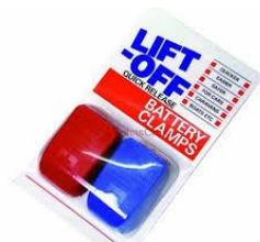
LIFT OFF BATTERY E805080 15.31