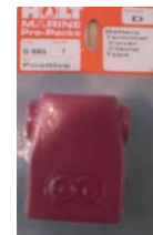
BATTERY TERMINAL COVER E663 POS RED 3.25 E894 NEG BLUE 3.25