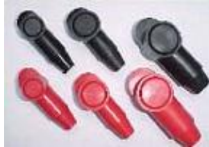
RED BLACK 6mm E824008 E824009 3.07 10-25mm E824010 E824011 3.59 35-70mm E824012 E824013 4.26 95-120mm E824014 E824015 4.58