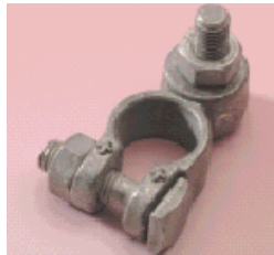
BATTERY TERMINALS 8mm BUTTERFLY STUD E805013 POS 3.50 E805012 NEG 3.50