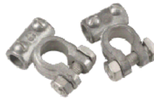
BATTERY TERMINALS STD SOLDERLESS 40' E805001 POS 2.92 E805000 NEG 2.92 UP TO 60mm sq' E805003 POS 5.40 E805002 NEG 5.40 UP TO 70mm sq E805005 POS 6.26 E805004 NEG 6.26