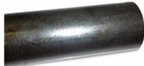
MILD STEEL FLUE PIPE 4.5" F13260 51.90