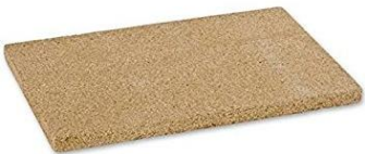
VERMICULITE BOARD 800 X 800 X 25 41.90 HS-364