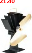
ECOFAN 800 230MM 123.73