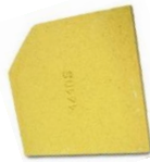
SQUIRREL FIRE BICKS F162 BACK 13.40 F161 SIDE 32.90