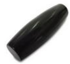
SQUIRREL FIRE DOOR KNOB F327 10.07 ASH PAN DOOR KNOB F328 6.50