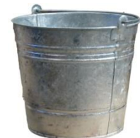
GALV BUCKET D218 10L 6.90 LARGE D135957 9.99 BLACK RUBBER BUCKET AT-090 D090 1.90