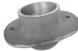
ROOF COLLAR 6" X 13 X 7" SUITABLE FOR ALL SOLID STOVES F601 56.50