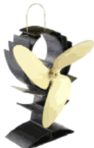
ECOFAN 802 265MM F14076 170.00