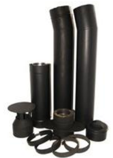
TWIN OFFSET F90024 562.32 STRAIGHT F90023 562.32