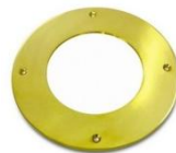
BRASS RINGS F3066 24.95 5" I/D, 8" O/D F3067 26.24 6"