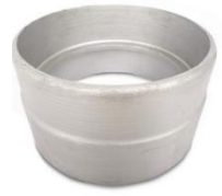
SOCKET ADAPTER F462 13.12