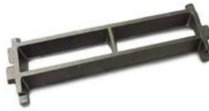
SQUIRREL FRONT BAR F107 20.90