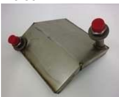
BACK BOILER SQUIRREL 239.99 F80023