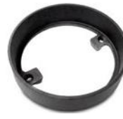
SQUIRREL FLUE RING F2160 41.90