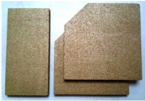
VERMICULITE SET 39.90 F151 SQUIRREL