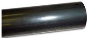
MILD STEEL FLUE PIPE 4" OD X 1500MM F401 43.90