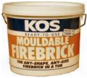
MOULDABLE FIRE BRICK F12021 6KG 21.40