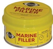
MARINE FILLER G171298 12.55