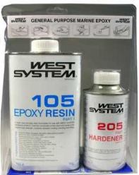
WEST EPOXY A 41.93 1KG RESIN & HARDNER G430014 206 SLOW G430012 205 FAST