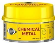
PP CHEMICAL METAL G2075535 12.71