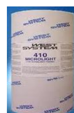
410 FILLER G430118 10.87