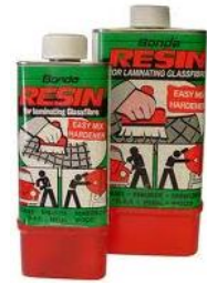
BONDA GLASS RESIN G05156 1KG 27.79 G05155 500ML 18.78 G05154 250ML 13.98