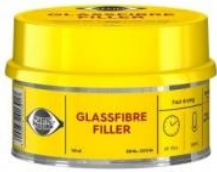
GLASS FIBRE FILLER G2074744 12.23