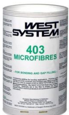
403 FILLERS G430078 8.86