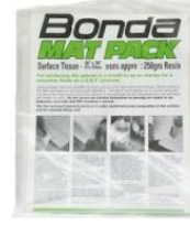
BONDA SURFACE TISSUE G05162 5.99