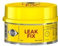
LEAKFIX 180ML G2074743 12.71