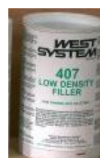
407 FILLER G430106 15.88