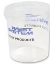
WEST MIXING TUB 800ML G430284 1.15