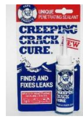
CAPTAIN TOLLY G570100 6.77 60ml G570701 16.09 250ml