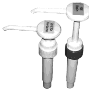
MEASURING PUMP 16.85 G430060