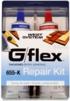
WEST GFLEX REPAIR KIT G430062 29.74