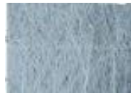
GLASS MATT BONDA SQ MTR 05161 8.54