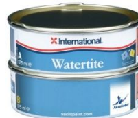
WATERTITE G560750 250ML 21.77