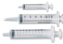
SYRINGE G430290 50ml 6.59