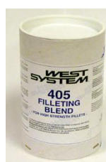
405 FILLER G430092 11.30