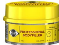
PP PROF BODY FILLER G2074747 11.48