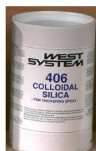
406 FILLER G430098 8.11