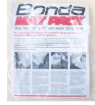
BONDA MAT PACK G05160 6.74