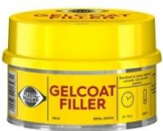
PP GELCOAT FILLER 180ML G2074745 16.09