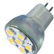
MR8 7.99 L9929