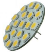
18 LED G4 REAR PIN L9937 8.99