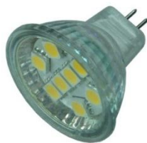
8 LED MR11 L9947 8.49