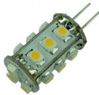
15 LED TOWER L9942 8.99