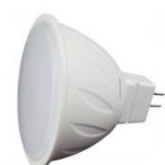
7W LED = 50W HALOGEN L9956 11.99