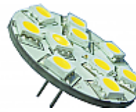
10 LED REAR PIN L9933 7.99