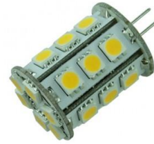
24 LED TOWER L9944 10.99