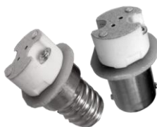
G4 ADAPTERS L9961 LES 2.99 L9960 SES 2.99