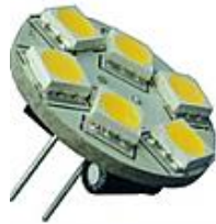
6 LED REAR PIN L9931 5.49