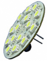
15 LED REAR L9935 8.49