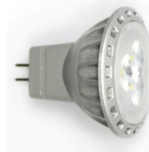
WIDE BEAM SPOT L9949 8.99