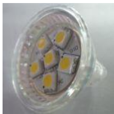
6 LED MR11 L9946 7.99