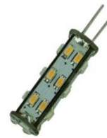
27 LED TOWER L9945 10.49