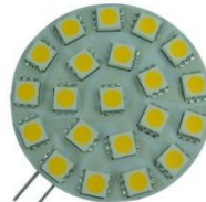
21 PIN G4 SIDE L9938 9.49