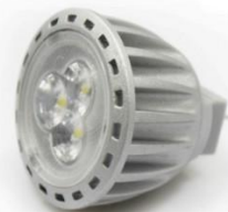
LONG SPOT L9950 9.99