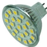
21 LED 9.99 L9953