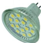
15 LED 8.99 L9952