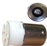
L9962 SBC SC 2.99