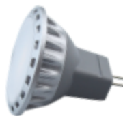
WIDE BEAM LED MR11 L9948 8.99