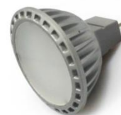
5W LED WIDE BEAM = 35W HALOGEN L9955 10.99