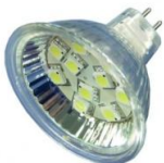
10 LED MR16 8.49 L99 51