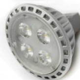
5W LED SPOT =35W HALOGEN L9954 10.99