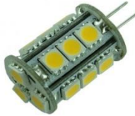
18 LED TOWER L9943 9.99