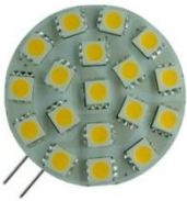
18 LED G4 PIN L9936 8.99