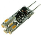
12 LED TOWER L9941 6.99