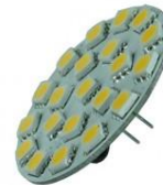
21 PIN G4 REAR L9939 9.49