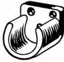
BUNK BED BRAKET D137691 x 2 W4