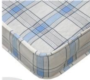
FRAMED SUPERIOR MATTRESS SPRUNG 13 GAUGE SPRINGS 11 GAUGE WIRE 30Z PAD ,12mm PEEL FOAM SEWN IN TOPPER