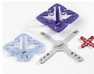
D40310 STAR MOBIL 31.20 SOFT EXTENSION PACK