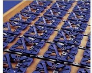
STAR MOBIL BASIC BED KIT A BED SYSTEM THAT ALLOWS AIR TO FLOW AROUND THE BED AND SUPPORTS THE MATTRESS. BOX OF 60 SPRING ELEMENTS, 50 X REGULAR AND 10 SOFT +10 TENSION CROSSES D40310 125.00