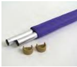
D350570 BUNK BED KIT D350572 SPARE POLES D350573 SPARE CANVAS