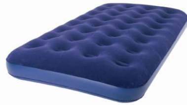
INFLATABLE MATTRESS D100161 SINGLE D100162 DOUBLE