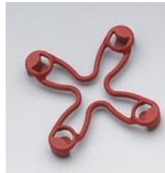
TENSION STAR CROSSES D0314 8.80