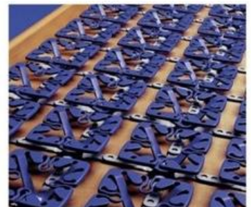
STAR MOBIL BASIC BED KIT A BED SYSTEM THAT ALLOWS AIR TO FLOW AROUND THE BED AND SUPPORTS THE MATTRESS. BOX OF 60 SPRING ELEMENTS, 50 X REGULAR AND 10 SOFT +10 TENSION CROSSES M40310 125.00