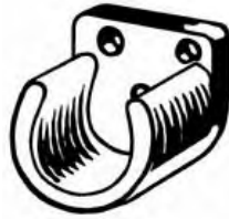
BUNK BED BRACKET M137691 x 2 W4