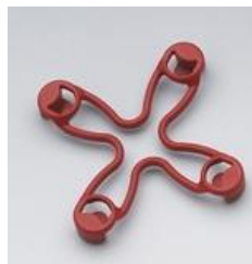
TENSION STAR CROSSES M0314 8.80