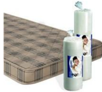
VACUUM PACKED FOAM MATTRESS IN A BAG HIGH QUALITY FOAM ONCE UNPACKED EXPANDS TO 6" DEPTH. DUST MITE RESISTANT