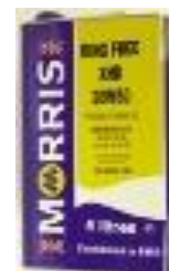
MORRIS HXD 20W-50 Q274921 25.48