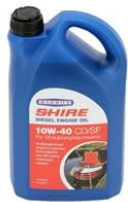
SHIRE OIL 10W-40 Q2797 31.50