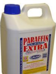
PARAFIN 4LT Q6677 11.99