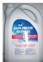
ELSAN GLYCOL FREE ANTI FREEZE Q9418 19.99