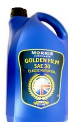
MORRIS SAE30 SUPREME CLASSIC Q274923 29.23