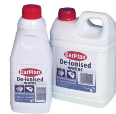
DE-IONISED WATER Q370114 1LT 2.29 Q370115 5LT 9.55