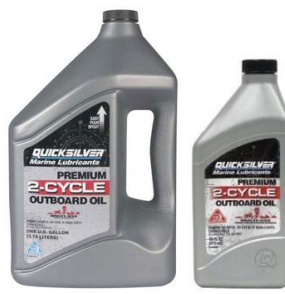
QUICKSILVER 2 STROKE PREM Q858021 1L 10.59 Q 858022 4L 38.56