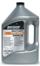
QUICKSILVER DIESEL OIL 4L SAE15W-40 Q538042 27.52