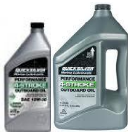
QUICKSILVER 4 STROKE OIL Q858045 1L 8.65 Q858046 4L 31.13