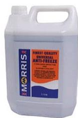
MORRIS ANTI-FREEZE Q274972 5LT 26.35 Q274970 1LT 5.96