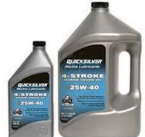
QUICKSILVER 4 STROKE STERNDRIVE – INBOARD Q86221 1LT 9.97 Q86223 4L 33.24