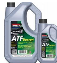
ATF DEXTRON 11 Q0066 1LTR 5.90 Q006 500ML 3.23