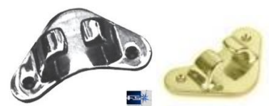
R1330 CH 10.48 R1331 BR 10.48