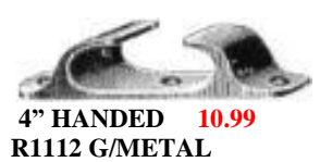
4" HANDED 10.99 R1112 G/METAL