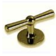
T STUD BOLARD 5" R71040 BR 21.12 R71041 CH 21.12