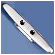
DECK MAST CLEAT R40007 3 1/4" 19.40 R40008 4 1/4" 21.38 R40009 5" 27.08