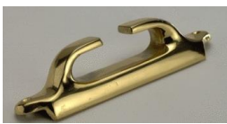
STRAIGHT FAIRLEAD WITH LIP 180mm x 30mm R70070 BRA 15.96 R70071 CHR 18.40 A-B-C-D-E