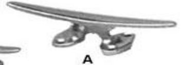
100mm CLEAT R71004 BR 7.37 R71005 CH 7.37