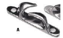
S/Steel HANDED FAIRLEAD 115mm R13797 PR 27.83