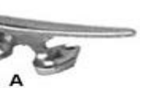
130mm CLEAT R71006 BR 9.67 R71007 CH 9.67