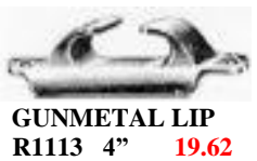
GUNMETAL LIP R1113 4" 19.62