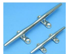
ALLOY DECK CLEAT R42390 S/S 9.53