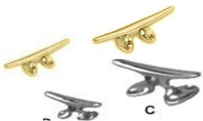
50mm CLEAT R71000 BR 5.71 R71001 CHR 5.71