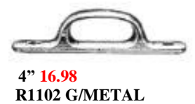
4" 16.98 R1102 G/METAL