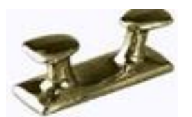
BOLT BOLLARD R71050 6" BR 35.23 R71051 6" CHR 35.23