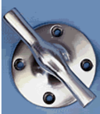
BOLLARD CLEAT R40073 4" 16.98