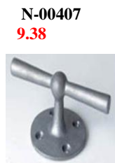
N-00407 9.38 GALV BOLLARD R1 42187 4" 8.80 R042 6" 8.80