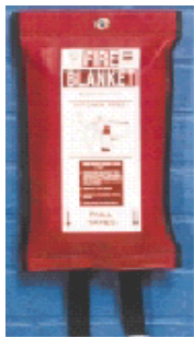
FIRE BLANKET F699008 17.79

ABC DRY POWDER (MULTI-PURPOSE) TO BS5423-1987