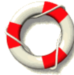
RED & WHITE LIFE RING S06752 26" 54.10