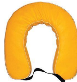
BESTO HORSE SHOE N16102 47.10