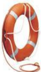
MAGNUM WITH ROPE S699020 24" 54.25