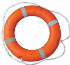
LIFE RING ORANGE S134200 51.40 2.5KG