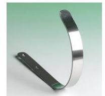
HOLDER R4172 6.36