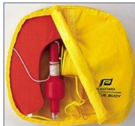
HORSE SHOE KIT S35922 59.70