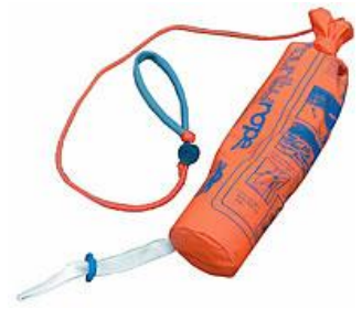
THROW LINE 30MTR S1766 32.64