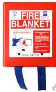
FIRE BLANKET F699006 SQ 17.56