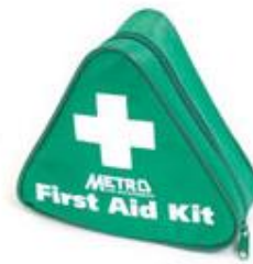
FIRST AID KIT F699041 14.08

ABC FIRE EXTINGUISHERS WATERWAYS APPROVED