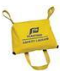
RECOVERY LADDER S29008 67.63