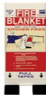
FIREBLITZ FIRE BLANKET SOFTPACK F699007 25.38