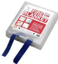
FIRE BLANKET F699070 12.99