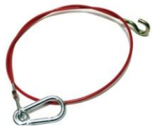
BREAKAWAY CABLE PLASTIC COATED T10017 6.95