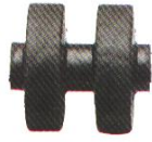
T487 7.47 DOUBLERUBBER ROLLER SIDE SUPPORT 16mm (5/8) bore