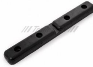
T4423 2.95 SNUBBER BLOCK 304mm LONG WITH 4 HOLES FOR 8 mm BOLTS CAN BE USED STRAIGHT OR AS V