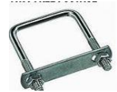
U BOLTS SELF LOCKING NUTS T495 2" X 3" 4.58 T496 2" X 2" 4.55