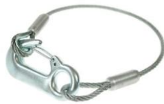
BREAKAWAY CABLE GALV T10018 4.80