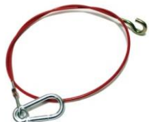
BREAKAWAY CABLE PLASTIC COATED T10017 6.95