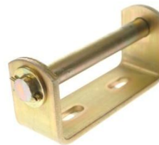
PLATED KEEL ROLLER BRACKET T4468 FOR T4431 11.59