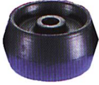
T488 5.40 SINGLE SIDE SUPPORT ROLLER 19mm BORE 4571A 216