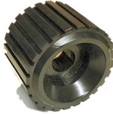
T1755 9.20 ROLLER COASTER 120 mm x 90mm BORE