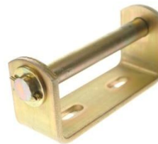
PLATED KEEL ROLLER BRACKET T4468 FOR T4431 11.76