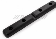
T4423 3.25 SNUBBER BLOCK 304mm LONG WITH 4 HOLES FOR 8 mm BOLTS CAN BE USED STRAIGHT OR AS V