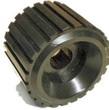
T1755 9.60 ROLLER COASTER 120 mm x 90mm BORE