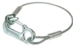
BREAKAWAY CABLE GALV T10018 4.80