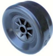
T4430 5.56 SNIPE ROLLER 100mm x 50mm 12mm BORE