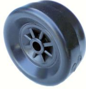
T4430 5.56 SNIPE ROLLER 100mm x 50mm 12mm BORE