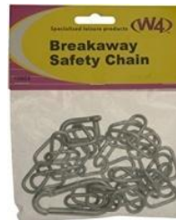
BREAKAWAY CHAIN T10003 6.25