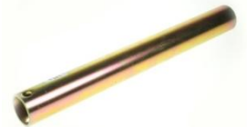
BRACKET SPINDLE T473 6.42