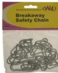
BREAKAWAY CHAIN T10003 6.25